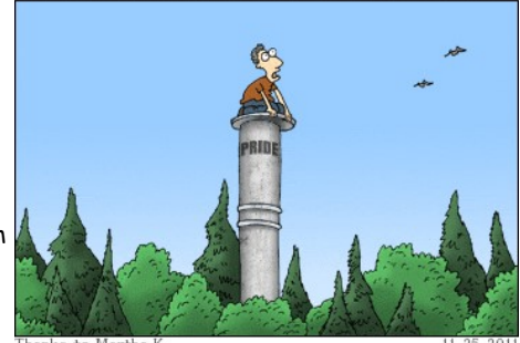
HELP! I'VE FALLEN AND I CAN'T GET DOWN