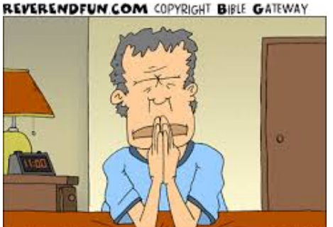
DEAR GOD, PLEASE GIVE ME PATIENCE ... AND I NEED IT RIGHT NOW!!!