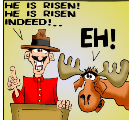
The Traditional Canadian Easter Greeting